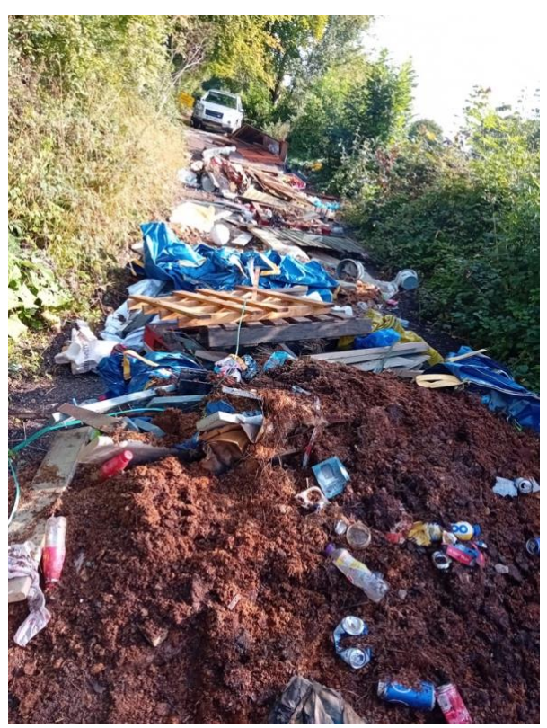
Above: Warren Lane 3<sup>rd</sup> September.